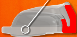
Myosa® TG Cross Section

Provides optimum jaw position and vertical opening for most patients.