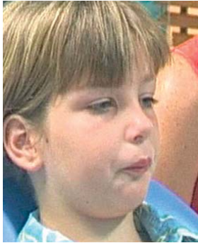
Function always = Form

...if left untreated, will cause poor facial growth, unstable orthodontics and TMJ Disorder.